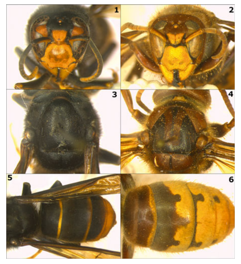
Fig. 2 1, Vespa velutina head; 2, V. crabro head; 3, V. velutina thorax; 4, V. crabro thorax; 5, V. velutina abdomen; 6, V. crabro abdomen.